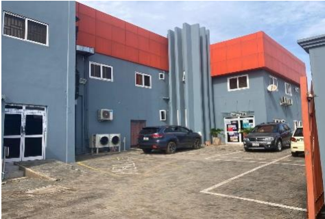
GANA PSH DIALYSIS CENTER 22 Bads