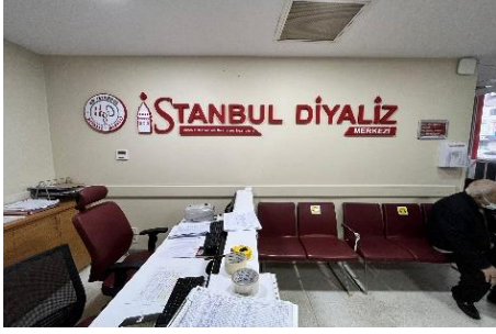
HD ISTANBUL DIALYSIS CENTER 35 Bads