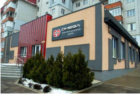
UKRAYNA OMEGA DIALYSIS CENTER 15 Bads